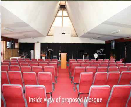
Inside view of proposed Mosque