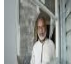
Broken glass door at the meeting hall of Toowoomba Mosque