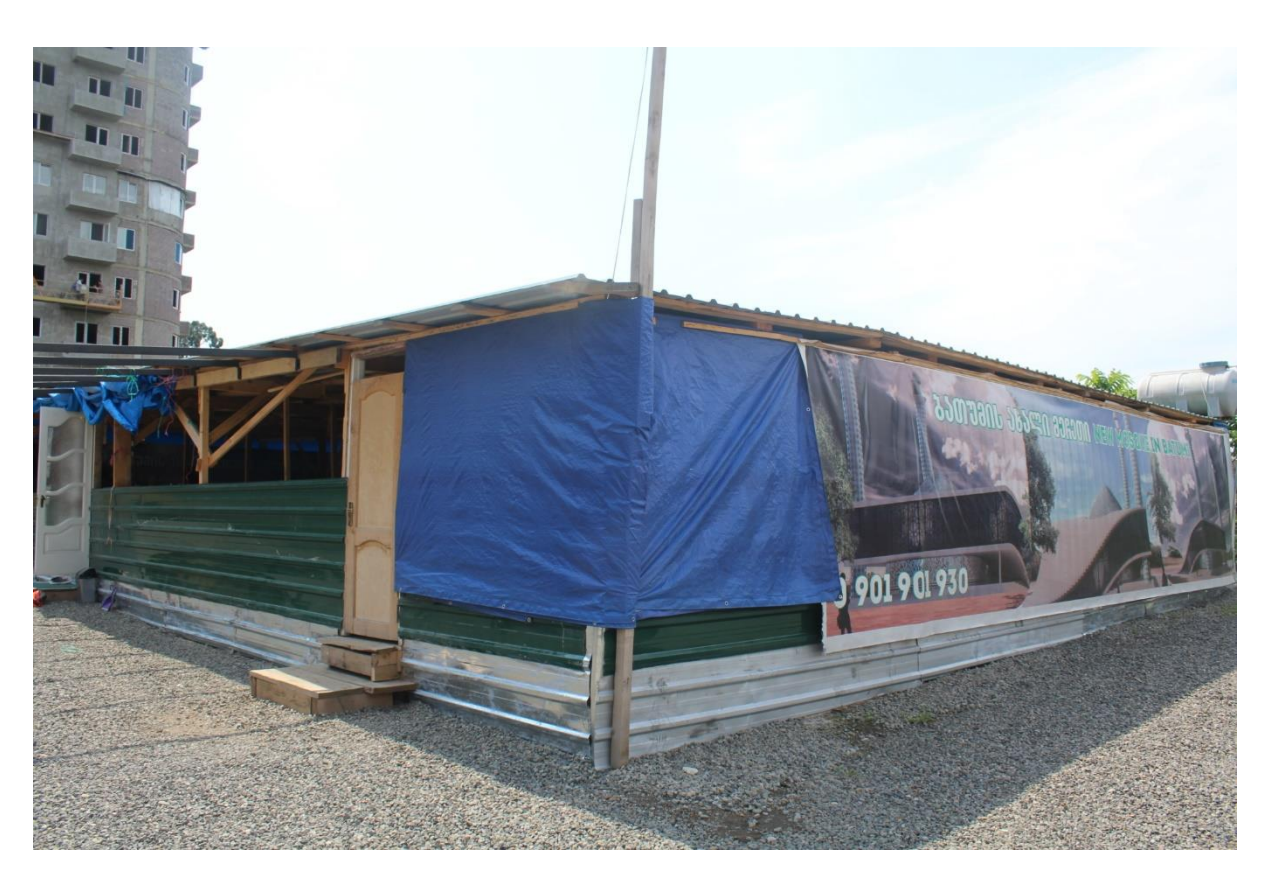
Makeshift mosque in Batumi