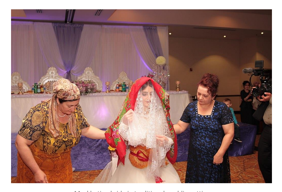
Meskhetian bride in traditional wedding attire

of the invaders – Arabs, Persians and Ottoman Turks. Georgian Muslims face hostility from the Orthodox Christian majority and discrimination and indifference by the state. Though Georgia's constitution guarantees freedom of religion and expression and espouses the principle of equality, there is a yawning gap between constitutional ideals and ground realities. While the Orthodox Church receives an annual grant of $12.5 million from the state, a meagre grant of less than $2 million is divided among four minority religious groups: Muslims, Armenian Christians, Jews and Roman Catholics.