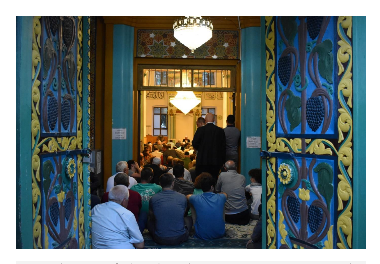
Prayer on the occasion of Eid-e Qurban in the Orta Jami Mosque, Batumi, 1 September, 2017