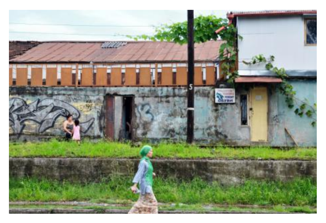
A Georgian Muslim woman walks down a Batumi street, Adjara, 2013.

Georgian Muslims face enormous hurdles in respect of construction of new mosques. Though Muslims in Tbilisi number over 150,000, there is only one mosque in the city. Similarly, Batumi – Georgia's second-largest city where Muslims make up a quarter of the population – has only one mosque (known as Orta Jami Mosque), which was built by a Georgian Muslim nobleman in 1886.