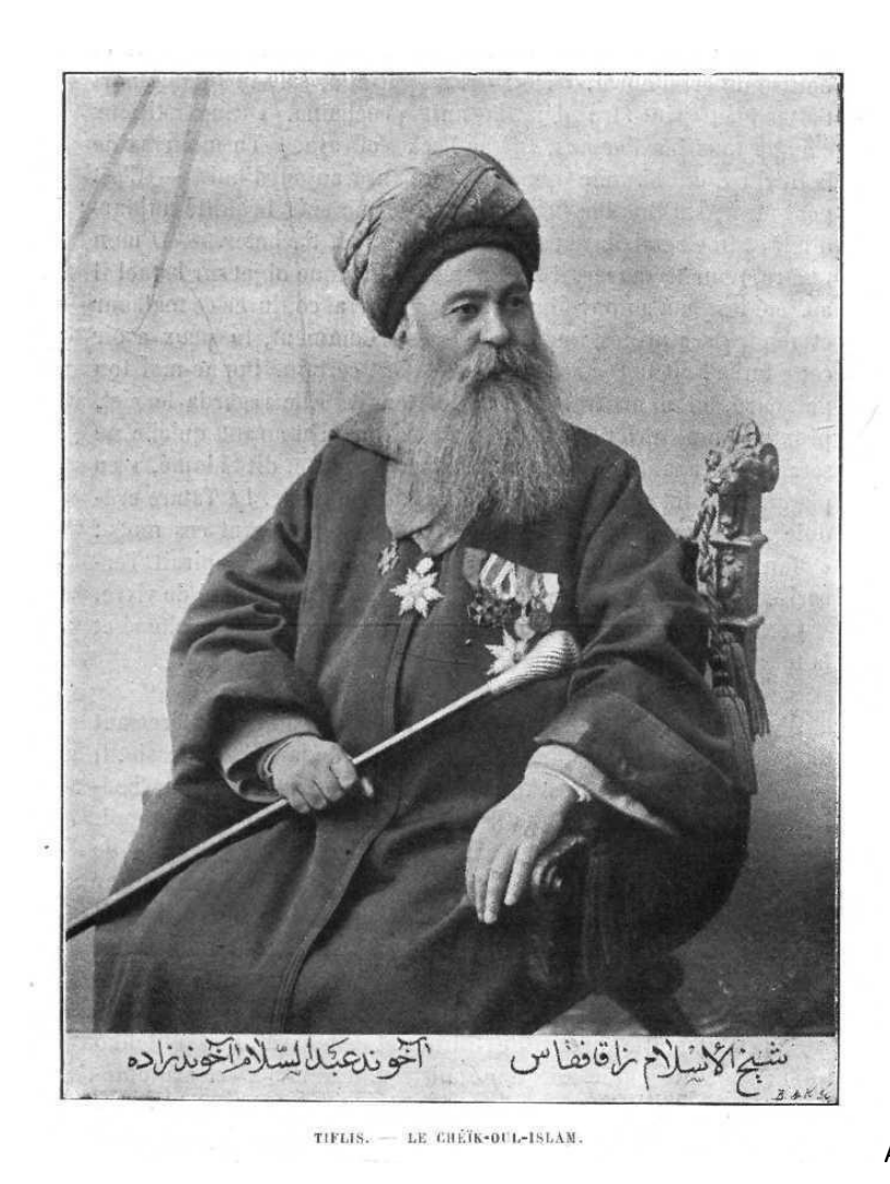
A Georgian Muslim Imam and scholar from Tbilisi

The number of Muslims in Georgia is estimated to be around 465,000, which accounts for 10.7% of the country's population. Muslims are mostly concentrated in the Adjara and Kvemo Kariti regions. Tbilisi has a sizeable Muslim population, estimated at 150,000. Muslims in Adjara – now known as the Autonomous Republic of Adjara – number about 133,000 and make up nearly 40% of the region. Adjara was a part of the Ottoman Empire from the 16<sup>th</sup> to the 18<sup>th</sup> century. Adjara Muslims are ethnic Georgians. Muslims form the majority in the Kvemo Kariti region.