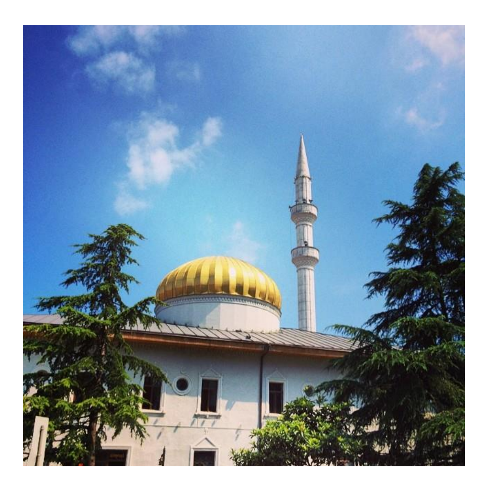
Orta Jami Mosque in Batumi