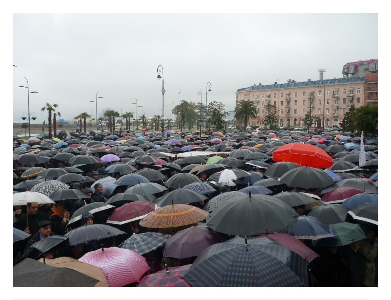
Muslims protested for the construction of the new mosque in Batumi in 2012

For several years, there have been negotiations between Georgia and Turkey concerning the restoration of Ottoman monuments in Georgia and Georgian monuments in Turkey. The Orthodox Church is opposed to this move.