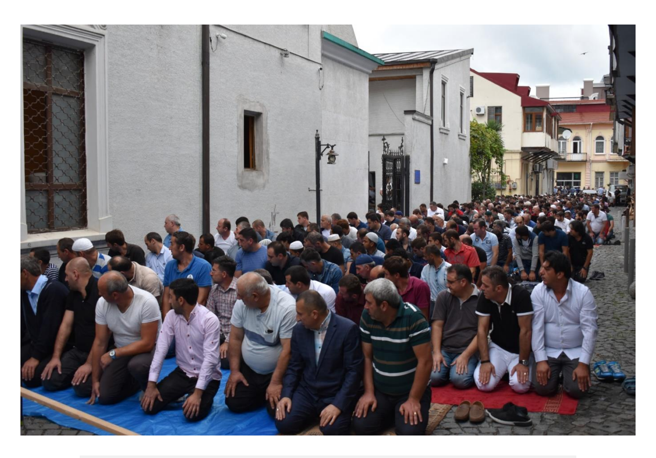
Muslims offer Friday prayers outside the Jami Mosque on the street in Batumi

The Orta Jami Mosque in Batumi can accommodate a maximum of 1,500 worshippers. On Fridays and the feasts of Eid al-Fitr and Eid al-Adha, thousands of Muslims roll out carpets on the pavement and streets to offer prayers. For the past two decades, Muslims have been making efforts to construct a new mosque in Batumi. They collected $400,000 and purchased a piece of land for the purpose and applied to the local authorities for permission for constructing the mosque. But despite verbal assurance, the permission was never granted. The main opposition against the construction of a new mosque in Batumi comes from the Orthodox Church and the local Christian population. Frustrated over the refusal of the local authorities, Muslims in Batumi decided to build a makeshift prayer hall on the premises they have purchased. Now Friday prayers are held in this makeshift mosque.