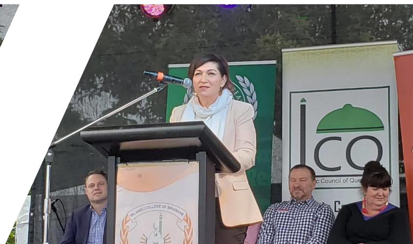
Leanne Enoch MP Minister for Environment and the Great Barrier Reef, Minister for Science and Minister for the Arts