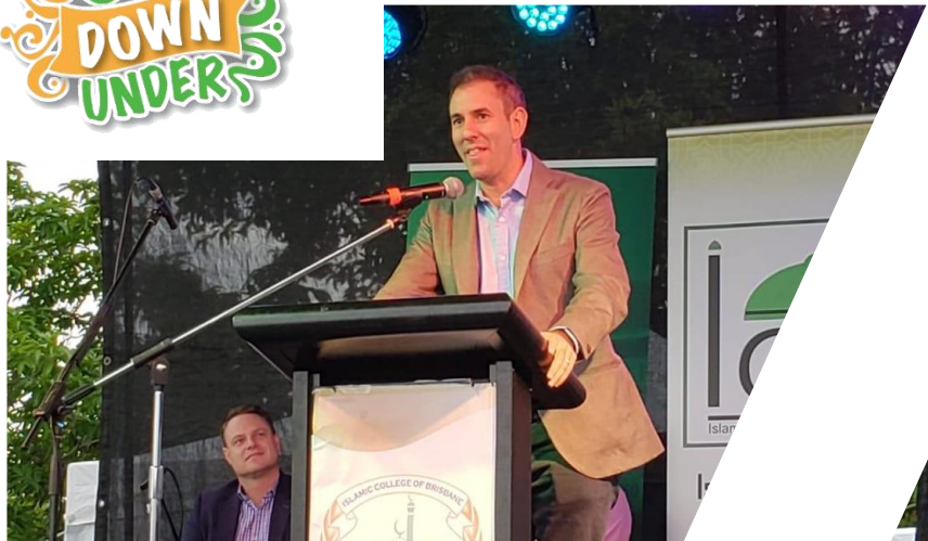
Dr Jim Chalmers MP Shadow Treasurer