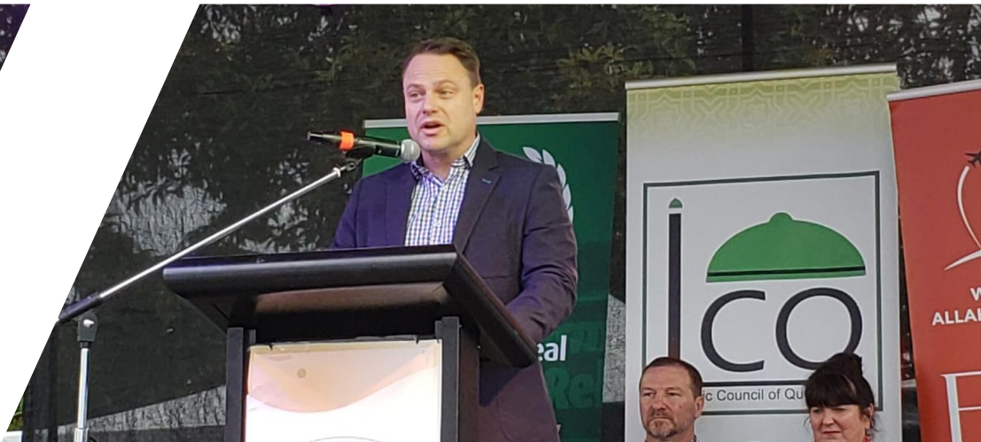
Lord Mayor Adrian Schrinner Mayor of Brisbane