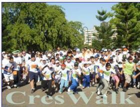
2.5km & 5km RUN