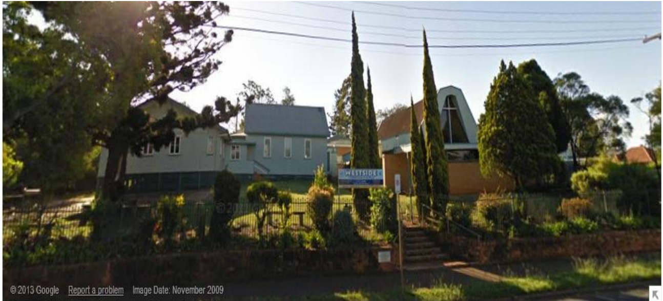
Partial view of the property with three existing structures.