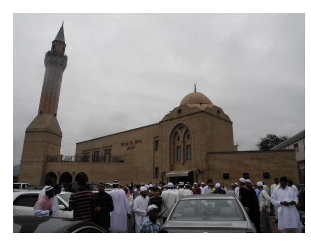
Eid morning at the Mosque

At 6.30 am on Wednesday morning we walked to the