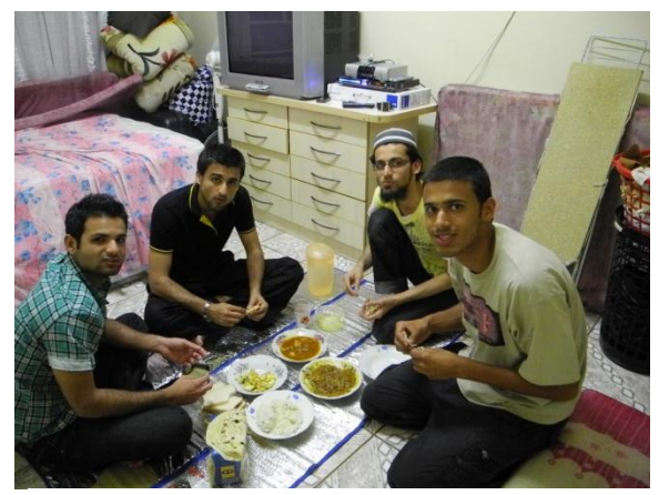
Dinner on floor

mosque for Eid namaz. I was shocked to see at least 500 people and Muslim representatives from every country. It's a depressing feeling having no one to hug after sallah, or not see any familiar faces, but I greeted my new Indian friends as if they were my closest family.