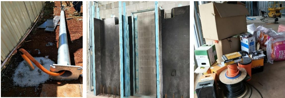
Main power line

The internal fitting works are progressing well as per schedule. All electrical cabling and connecting with main supply line are now completed. Air-conditioning conduits, and cables for security camera and sound system are all fitted. The plumbing connections have been checked and certified by Toowoomba Regional Council.