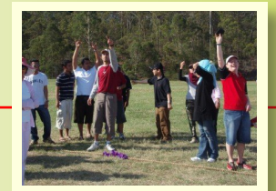
Plate of food or drinks to share Decorations Disposable plates/cups/cutlery Soccer ball/basketball/ cricket gear (Darul Uloom has volleyball net) Hats / sunscreen or umbrellas if it Rains Ropes and tarpaulins, picnic chairs Mats for salat