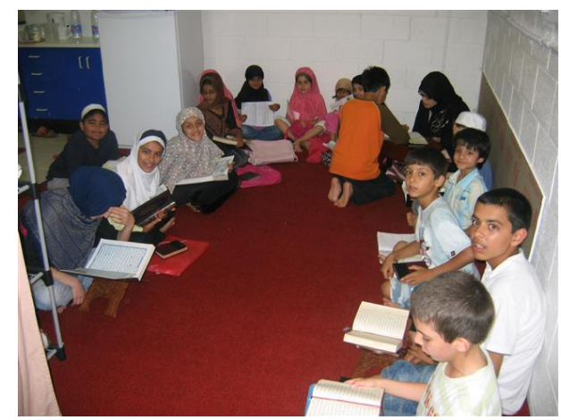
Our students learning...