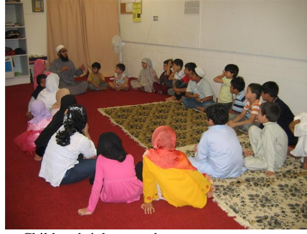
Children brighten up the centre